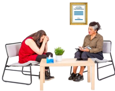
Mental Health services