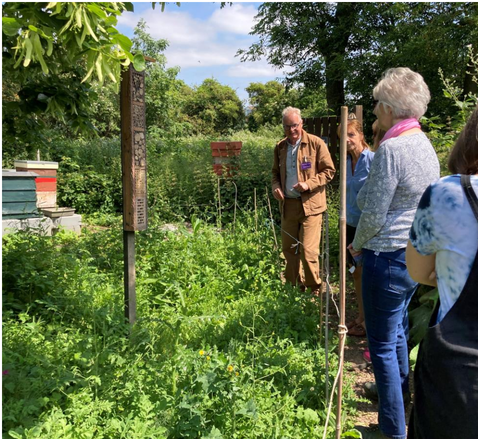
Photo: Age UK HW Gardening Group at Worcester Community Garden